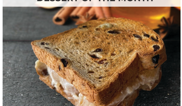
APPLE PIE PANINI $3.5

HONEY WHIPPED CREAM CHEESE | CINNAMON BROWN SUGAR APPLE SLICES | RAISIN BREAD