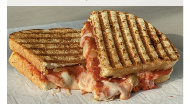
PIZZA PANINI $5.50

ITALIAN SAUSAGE | PEPPERONI | PEPPERS BLACK OLIVES | ONIONS | MOZZARELLA